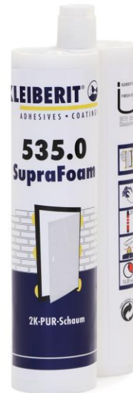
KLEIBERIT 535.0 SupraFoam in the double cartridge